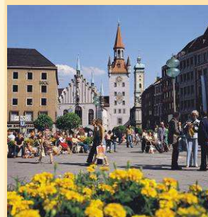
Marienplatz Munich

Please note that for groups of more than 30 persons you have to calculate extra guides for walking tours and museum tours.