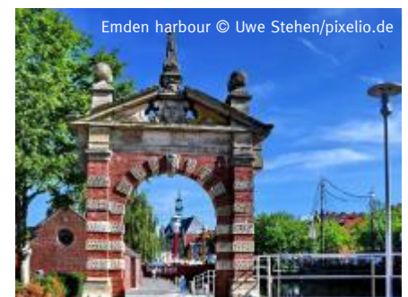
Emden harbour

7. Day: Island Langeoog – Aurich – Emden (approx. 65 km) You leave Langeoog in the morning. Back on the main land you cycle along the Ems Jade canal which leads you nearly car-free to Emden.